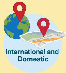
International and Domestic

Sometimes events happen that help or hurt almost all of the companies in a specific industry. For example, if the price of oil declines, many stocks in the oil industry could suffer.